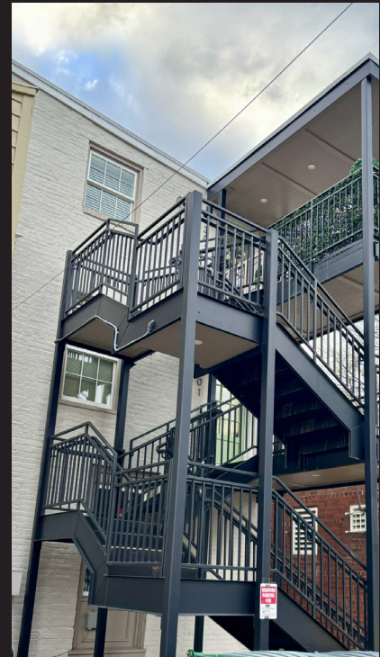
These are examples of exterior staircases found in the historic districts.